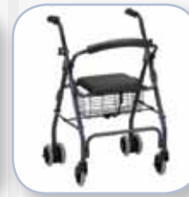
Walkers & Frames