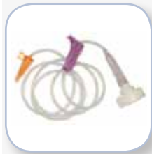
Feeding Accessories & Tubes