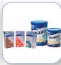
Nutritional Feed Supplements