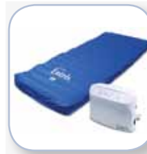
Pressure Care Management

Household and Mobility equipment and aids for your daily living needs that include: