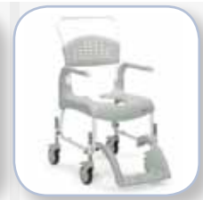
Bathroom & Household Aids